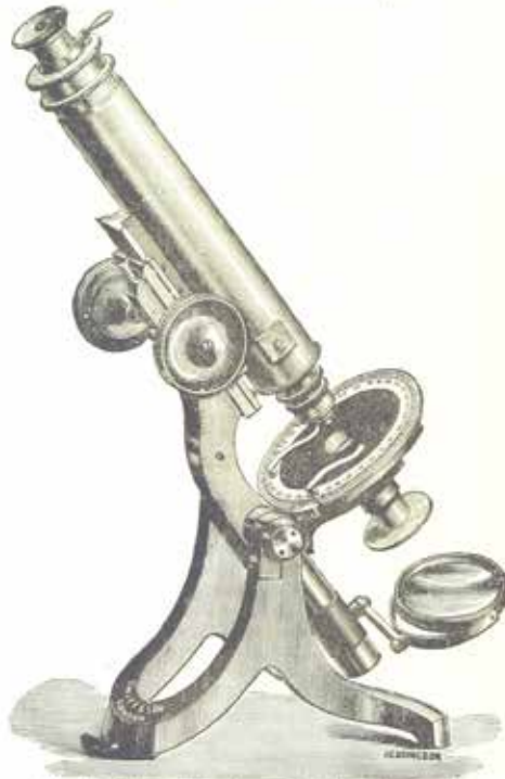
Fig. 14.—Petrological microscope with rotating stage.

so as to converge the light upon any crystal brought into the centre of the field.* Some means of focussing it within a short